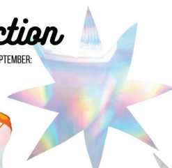
40" IRIDESCENT STARBURST