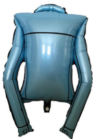
22" JEAN JACKET