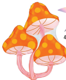
40" MUSHROOM SHAPE