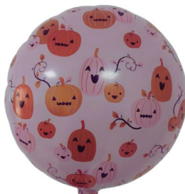
18" HALLOWEEN PRINT